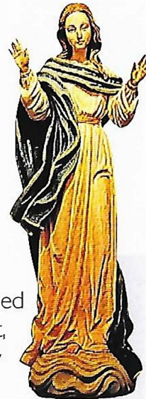
The Immaculate Conception statue graces our National Headquarters in New York